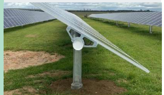
↑ Single axis trackers

To meet the visibility requirement, two television screens were installed (by client) in the shop with a live feed provided from NSE's monitoring platform. In this way, customers have a live view of the system's output data.